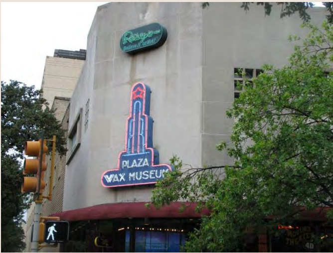
Wall-mounted signs are typically mounted parallel and fastened to the wall of a building above the primary entrance. This unique sign complements the building it is attached to.

Building-mounted signs, such as projecting signs or wall-mounted signs, play a significant role in complementing—or potentially detracting from—the character of a historic building and the surrounding district. Appropriate use of these sign types can help reinforce the historic character of the streetscape and the buildings they are intended to serve. Projecting signs are typically oriented towards pedestrians, making them most suitable to commercial or mixed-use districts with a more urban character.