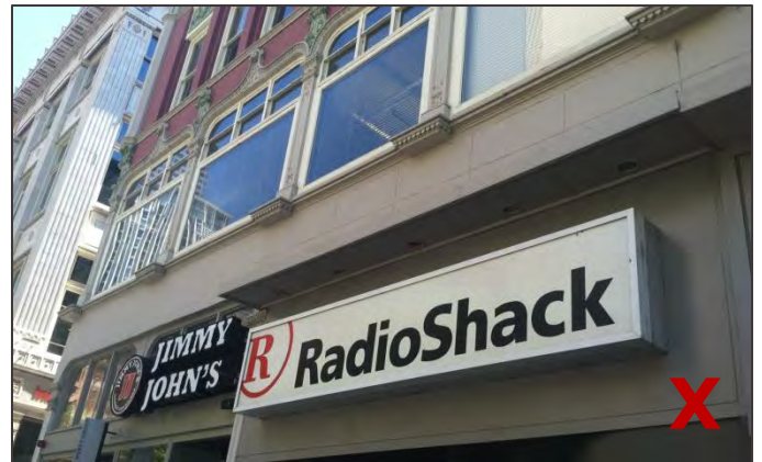
Too much variation in the scale, design, and placement of signs on a commercial storefront creates a visually cluttered, confusing environment for pedestrians.