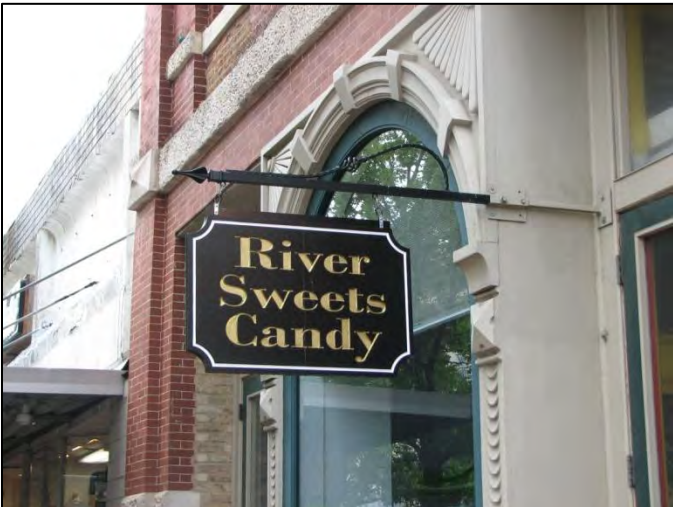
Signage for non-residential building types should be modest in scale and design so as not to distract from the historic character of the building it serves or the surrounding district.