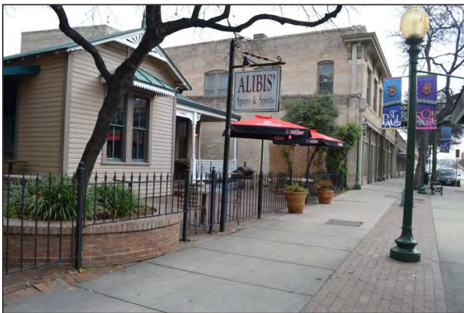
The small-scale freestanding signs above complement the historic character of the converted historic residences they serve.