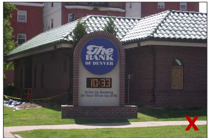
"Suburban-style" monument signs or electronic signs are not characteristic of San Antonio's Historic Districts and should not be used.