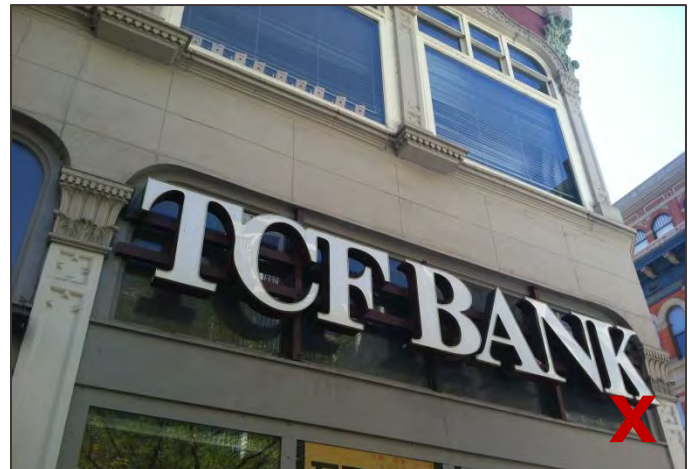
The scale of building-mounted signs should complement, rather than visually compete with the historic structure(s) it serves.