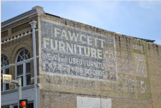
Ghost signs or other signs characteristic of the building's or district's period of significance should be preserved as historic buildings are rehabilitated for alternative uses.

Signs were historically attached to or placed near buildings and designed to complement the overall character of the building while conveying necessary information. New signs should not detract from the character-defining features of the building or damage elements of the historic building. The preservation of historic signs is also important as the adaptive reuse of historic structures occurs over time.