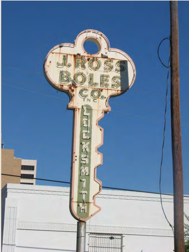
Historic freestanding sign in Downtown San Antonio.

Freestanding signs are not attached to a building, and may include information on either or both sides. Small-scale freestanding signs can help reinforce the historic character of a residential buildings and streetscapes that have been adapted for office and retail uses, while providing necessary identification for businesses.