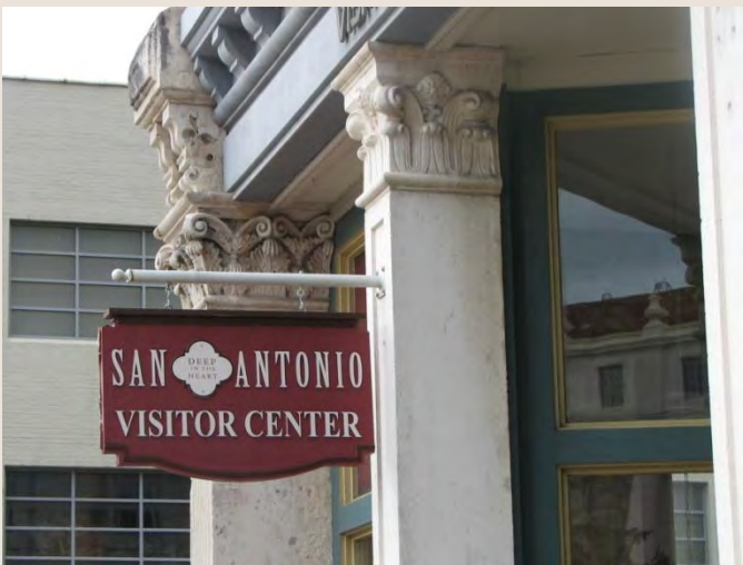
Projecting signs are generally two-sided signs suspended from the building and mounted perpendicular to its face.