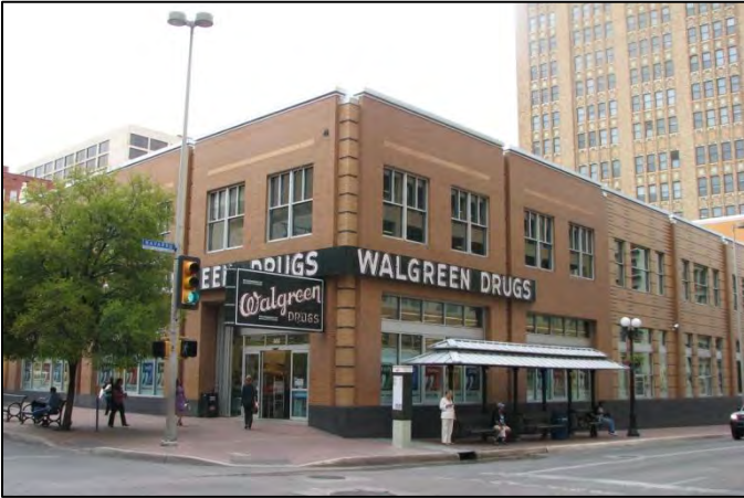
Corporate signage should reflect the historic character of the district.