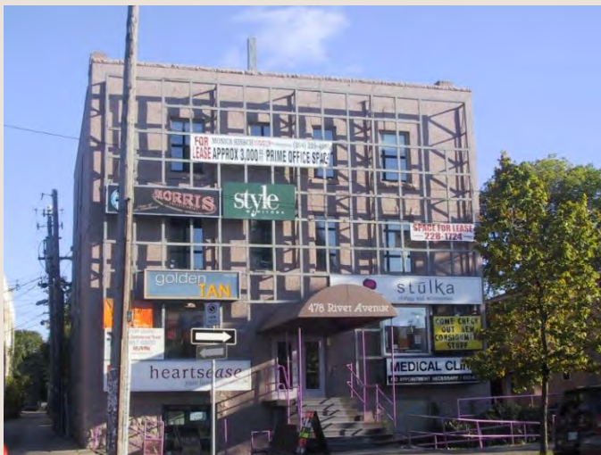
Excessive signage and poor signage placement can be distracting and create visual clutter.